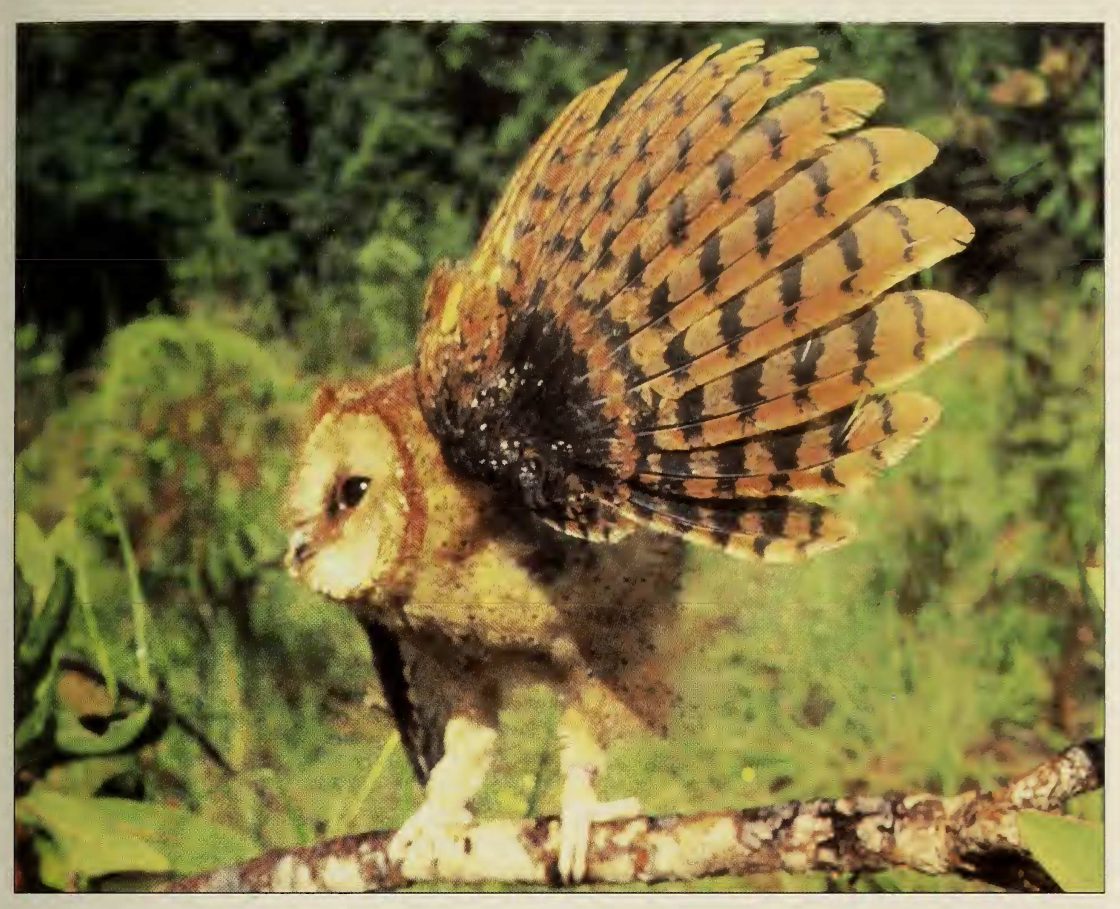
Congo Bay Owl, Phodilus prigoginei wing-stretching, Itombwe, May 1996 (T. Butynski).